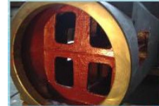
COLUMN:box structure, increase rigidity